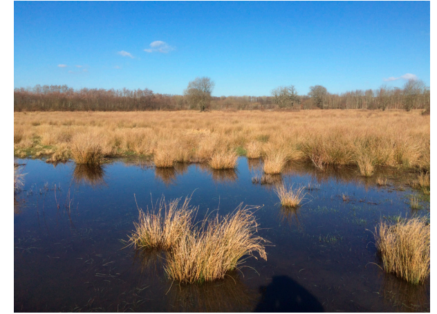
Top: Left, Book club - see p13. Right, Extension on Hothfield Heathlands on a sunny February day. Bottom: GCN habitat works Hothfield Heathlands